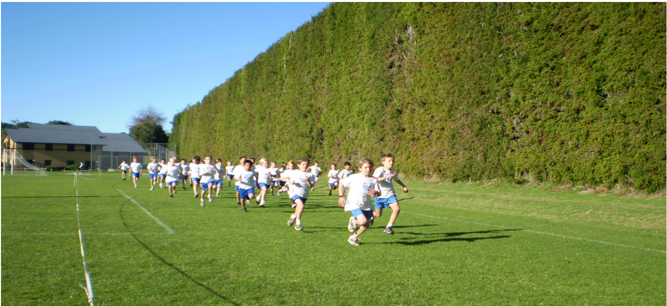
Bethlehem College Year 5 boys beginning cross country race