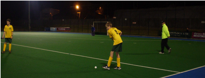
Otumoetai Intermediate winning during first half