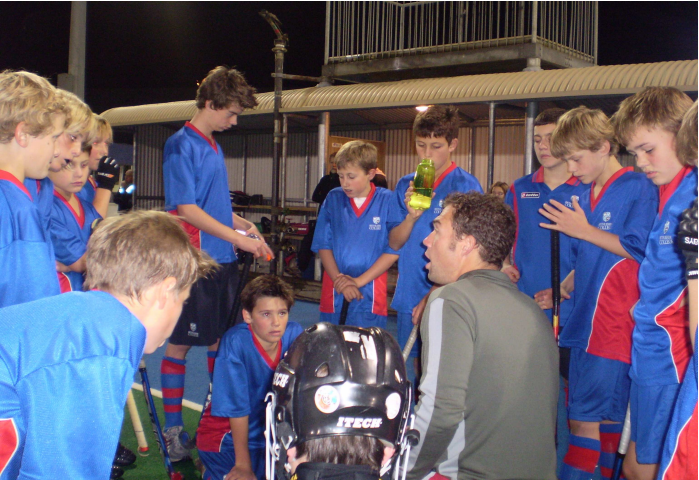
BC team talk before making comeback in second half