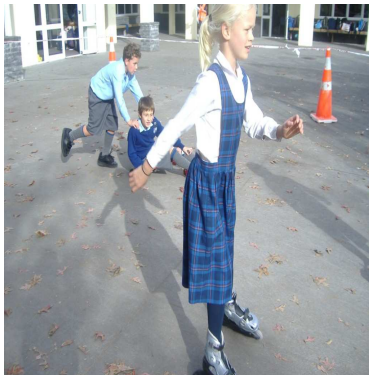
D3 kids wild on wheels day